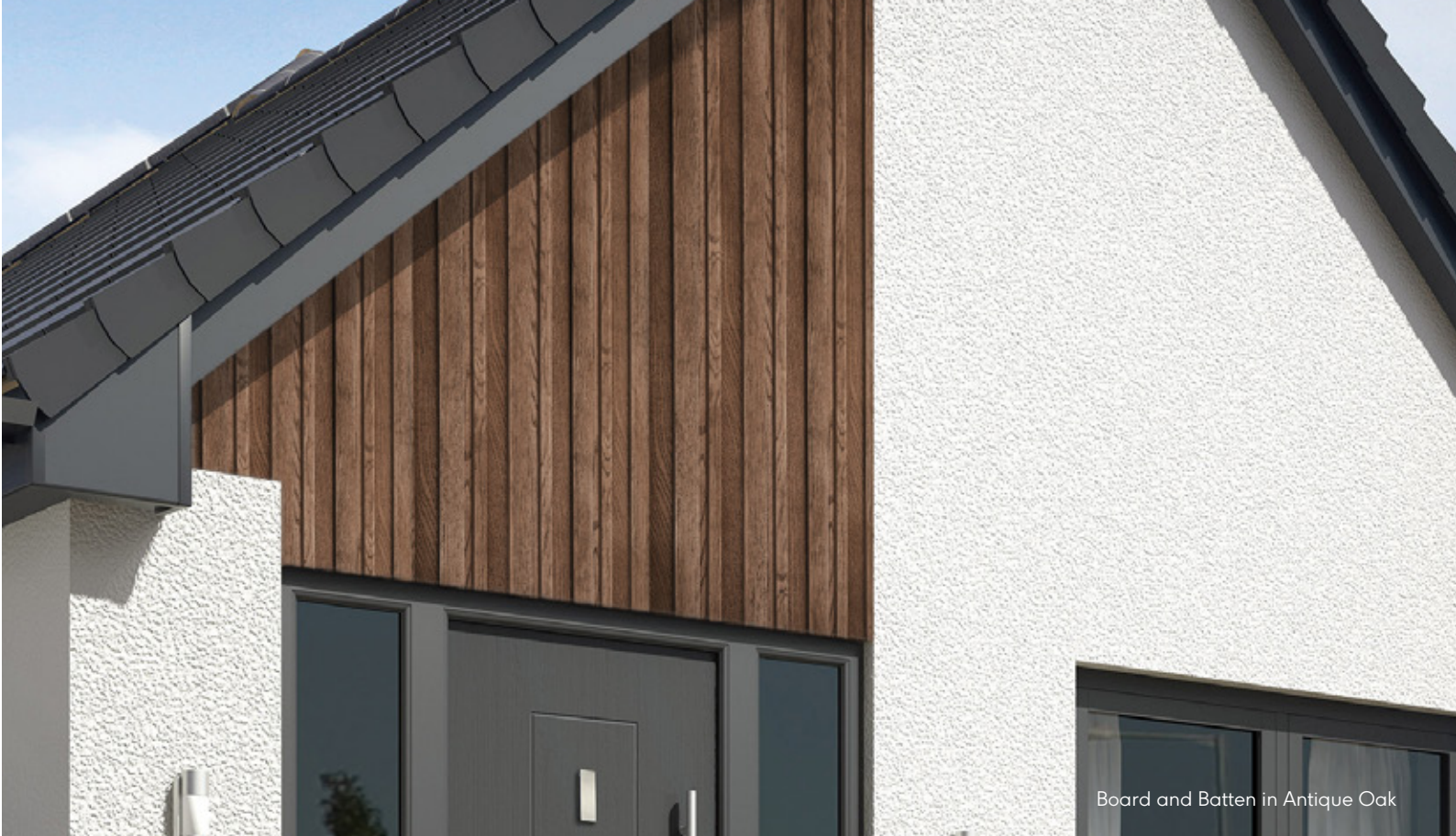
Board and Batten in Antique Oak