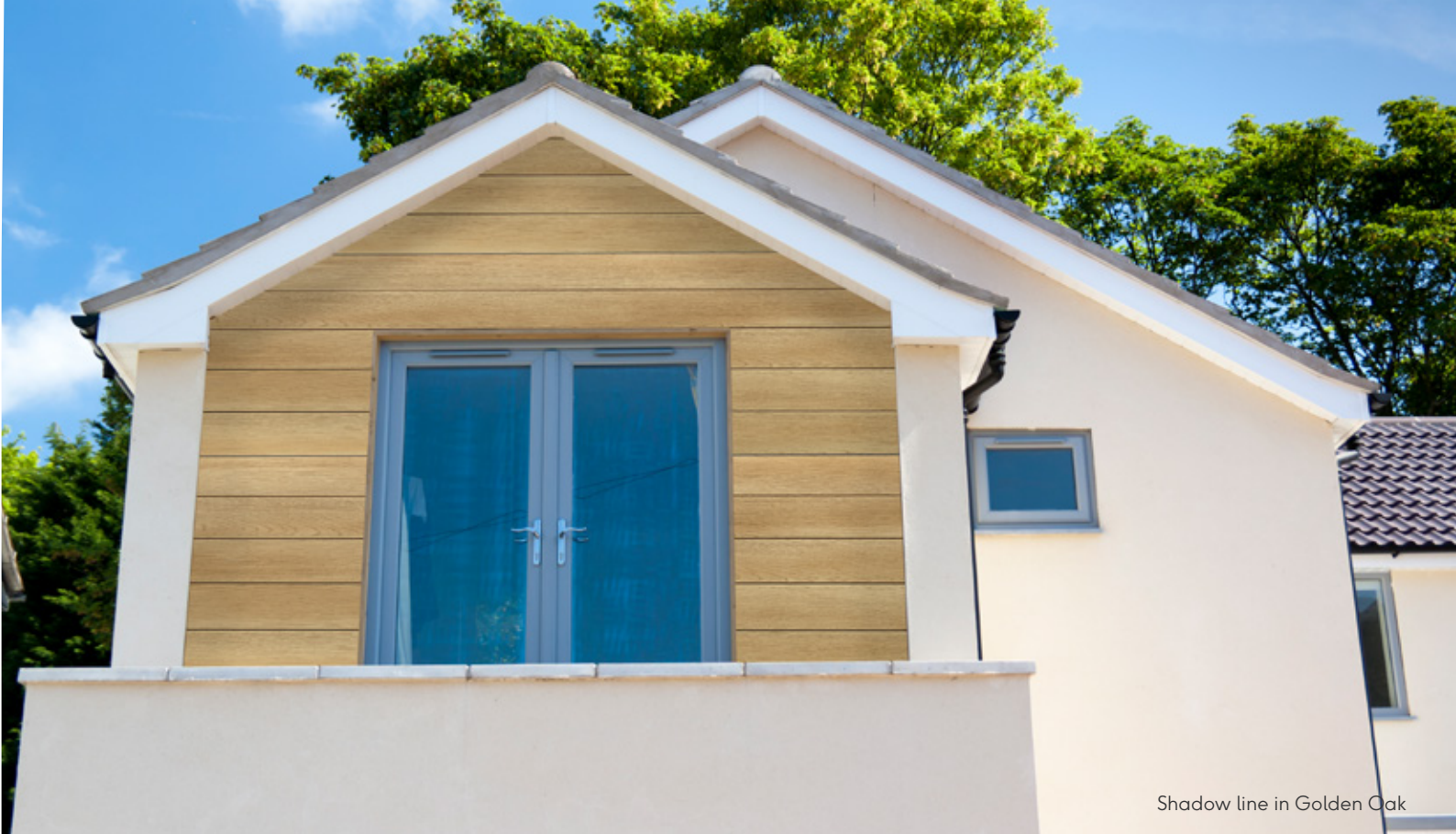
Shadow line in Golden Oak